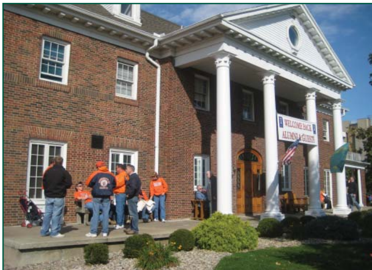
Photo captions: (top to bottom) Alumni gathering outside the house before the meal. Alumni and members enjoying the annual AGR homecoming meal and sharing stories at the Chapter House. Junior Class homecoming float: "State Can't Stop These Guns!"

The chapter house was open for tours and proudly displayed the newly remodeled chapter room including the three new couches, 52" plasma TV and state of the art sound system. We had also found some old slides while cleaning the basement that were on display in addition to some scrapbooks and record books from the 1940's and 1950's. Following the meal, there was a brief alumni board meeting which discussed the current conditions of the chapter and also some upcoming projects for the chapter house. Once again, thank you to all of the alumni who came and we hope to see more of you next year!