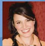
Rebecca St. James