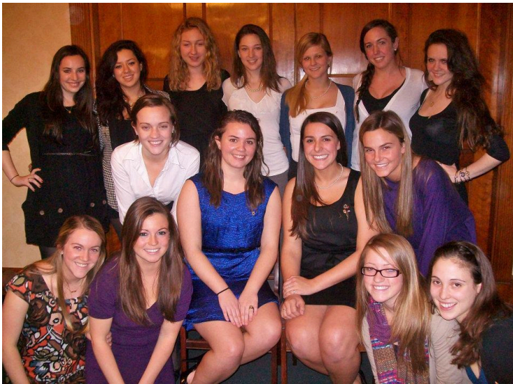
2012 Executive Board, Alpha Chi Omega