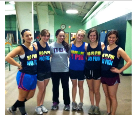
Pi Phi plays dodgeball for Alternative Spring Break